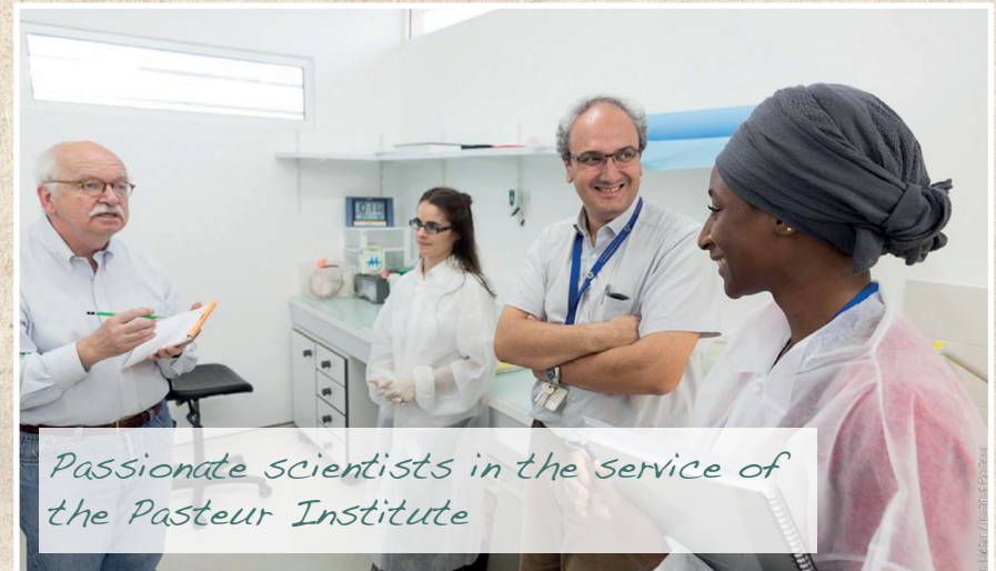
Passionate scientists in the service of the Pasteur Institute

For all that, in this general torpor, Maripassoula is the home of a surprising activity, that of the entomologists of the Pasteur Institute of Guiana. Their legitimacy springs from the field. This is asserted enthusiastically by the director of the Institute when he offers to take me with him. His eyes gleam with the idea of adventure that awaits us. I'm not sure I share his enthusiasm. Although my head, which has always been too big, has little chance of shrinking with Zika virus, I have direct knowledge of Guilain Barré syndrome. It struck my mother. Seeing her paralysis advance day by day was hardly a pleasant experience. But let's calm down, I'm protected for the time being. These pioneers in the combat against vector borne diseases are here because the Pasteur Institute in Cayenne