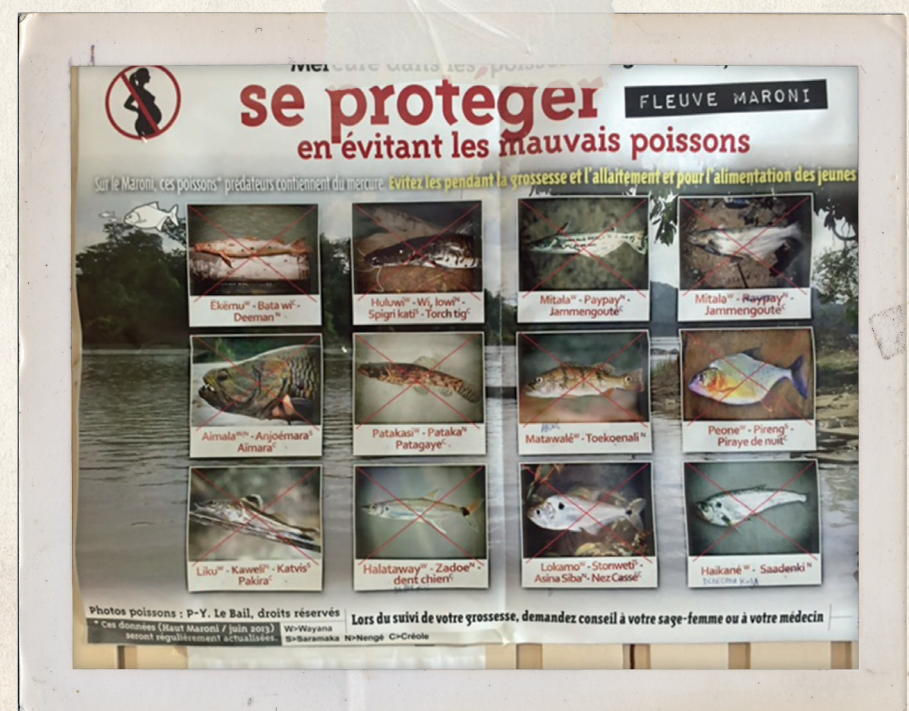
... and the bad fish ...