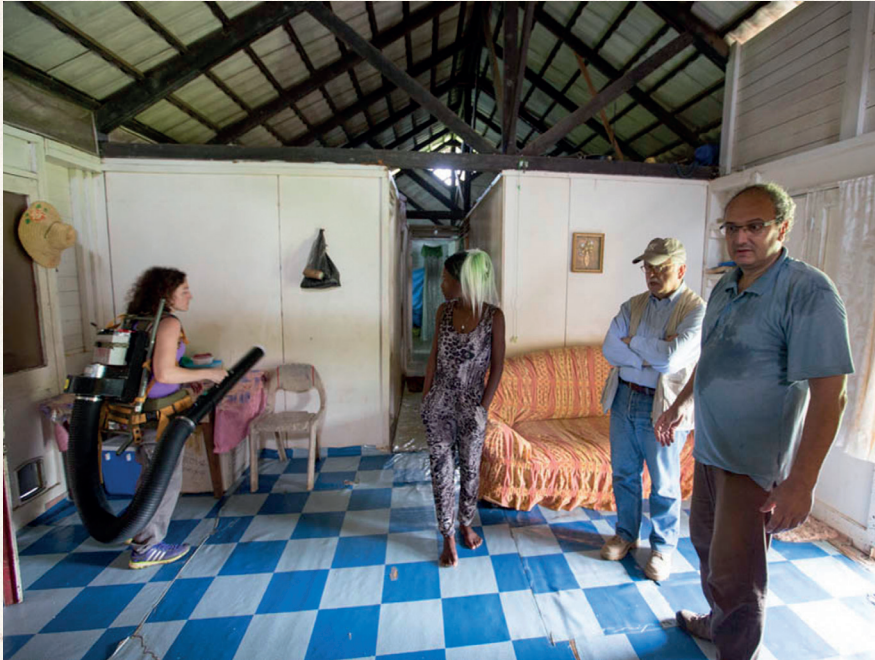
"Blond Ponytail" and a portable insect vacuum device

new adult mosquitoes emerge in only a week. This harvest was judged satisfactory, since the entomologists were attacking adults. Aedes like human habitations. So that's where they have to be found.