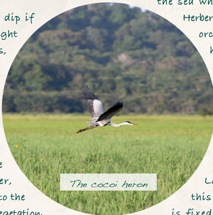
The cocoi heron

so intense that one doesn't know when the rain has stopped, where the light changes every second, sometimes vivid yellow, then green and suddenly grey, where shapes follow and link with each other; perhaps he feels that all this motion is like music? Jean-Louis has opened