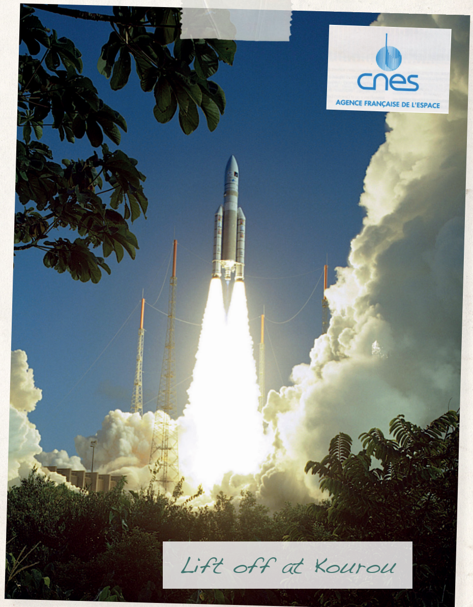
Lift off at Kourou

A hot (average 26°C) and wet (rainfall : 2,900 mm a year) country, covered with forests (98%), the beautiful and luxuriant Guiana has no lack of water. Besides the two rivers forming its frontiers it is crossed by countless others.