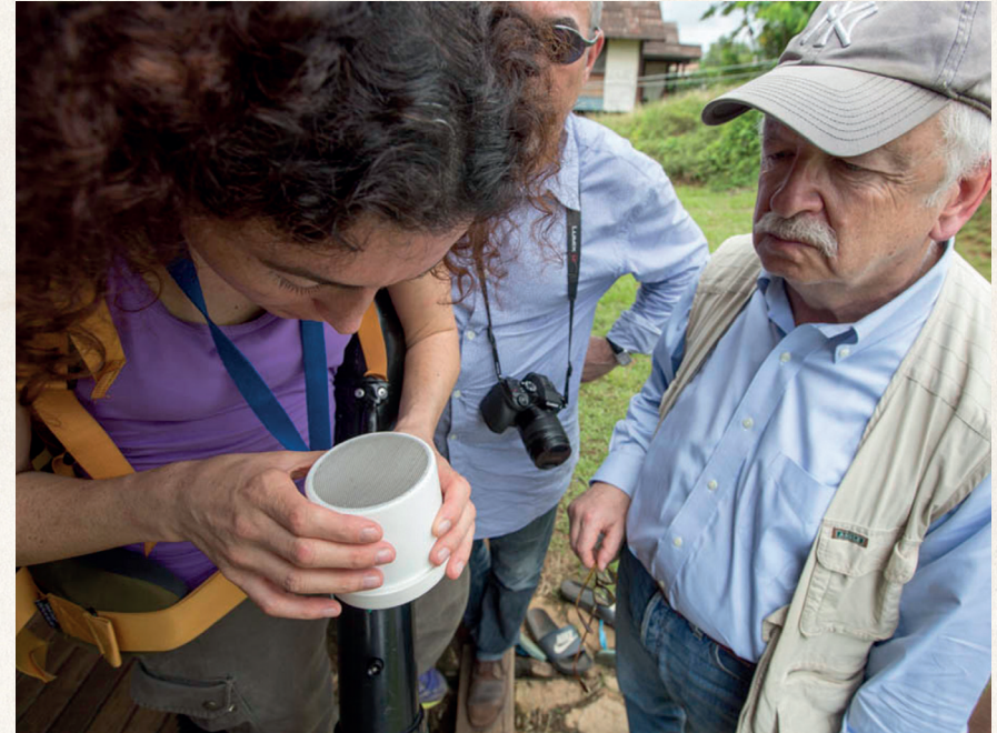
The culprits are at the bottom of the pot

The tiger mosquito likes to live in the immediate vicinity of man. The hunt is over and the girl