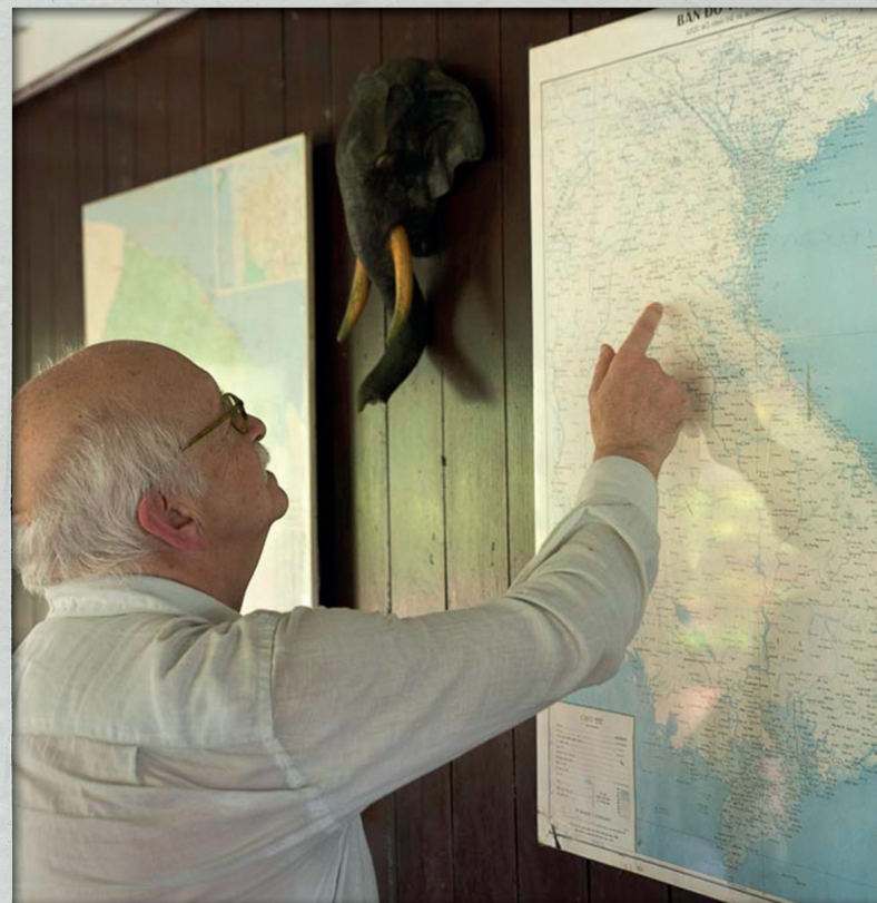
From Laos to Cacao

The young waiter doesn't know from which part of Laos his parents come, but he remembers the date of their arrival, before he was born : 3 September 1977. He also remembers the time: just after midnight. A coach came to fetch them from Cayenne airport. They got off it in the pitch dark, in the dead of night. Why was it necessary to take such pains to hide them? Who would want to harm them? Twenty lucky