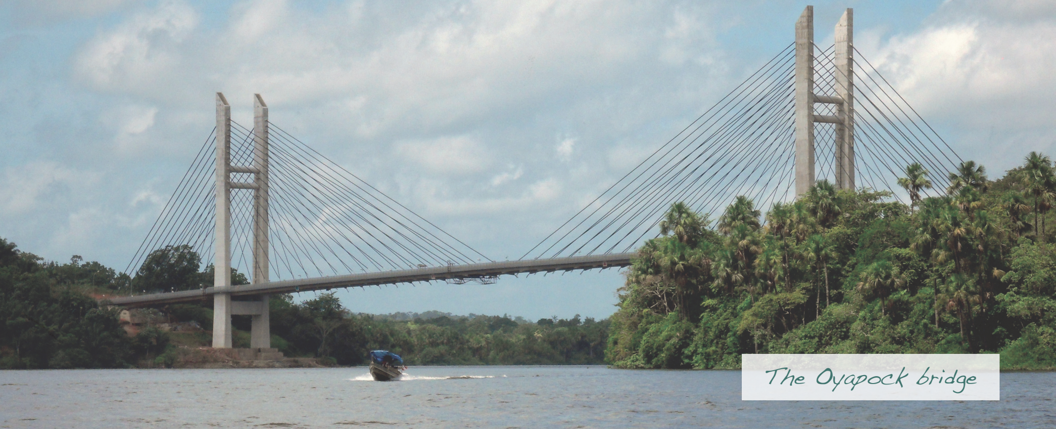
The Oyapock bridge