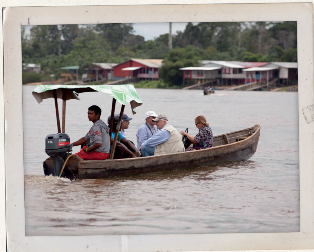
Crossing Maroni to Suriname

So I went to Surinam. Far from me the desire to generalise. I knew nothing about this country. All I can say is that the bustling activity that reigns here on the other side of the Maroni, opposite the French apathy, is driven only by trade. They sell everything here. Anything that could satisfy the needs of a clientele mainly composed of gold panners. Naturally, women are sold, of all ages and types. Food is sold,