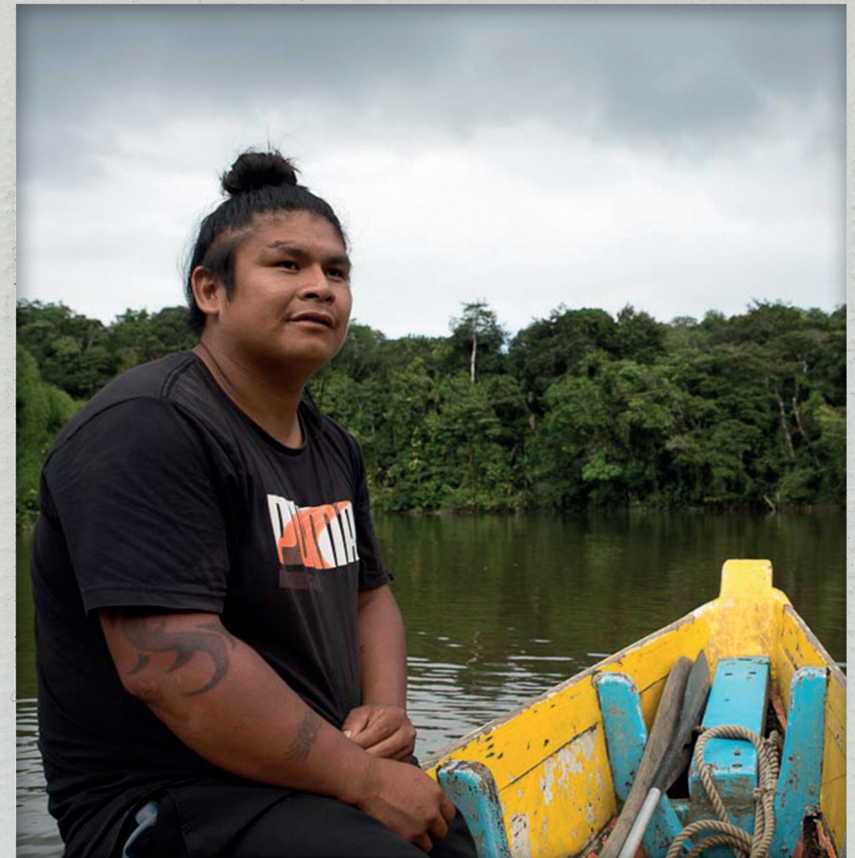
On the Comté River, with an Amerindian canoeist