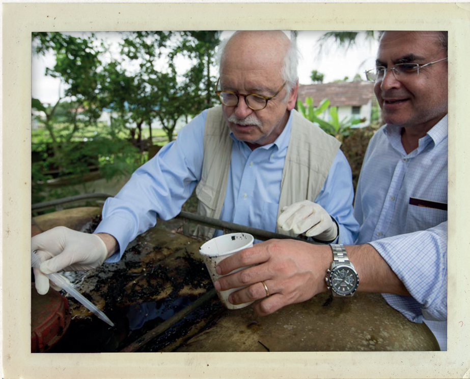
Collection in breeding grounds

is the National Reference Centre for Malaria. That is to say that it must gather all the data known on the presence of this disease in Guiana. Thus it supplies data to the World Health Organisation. It is also an EPRUS, the French acronym for Emergency Health Response Establishment, a network set up in 2007. Dengue, Chikungunya and Zika, not to forget flu viruses; always recurring, always threatening.