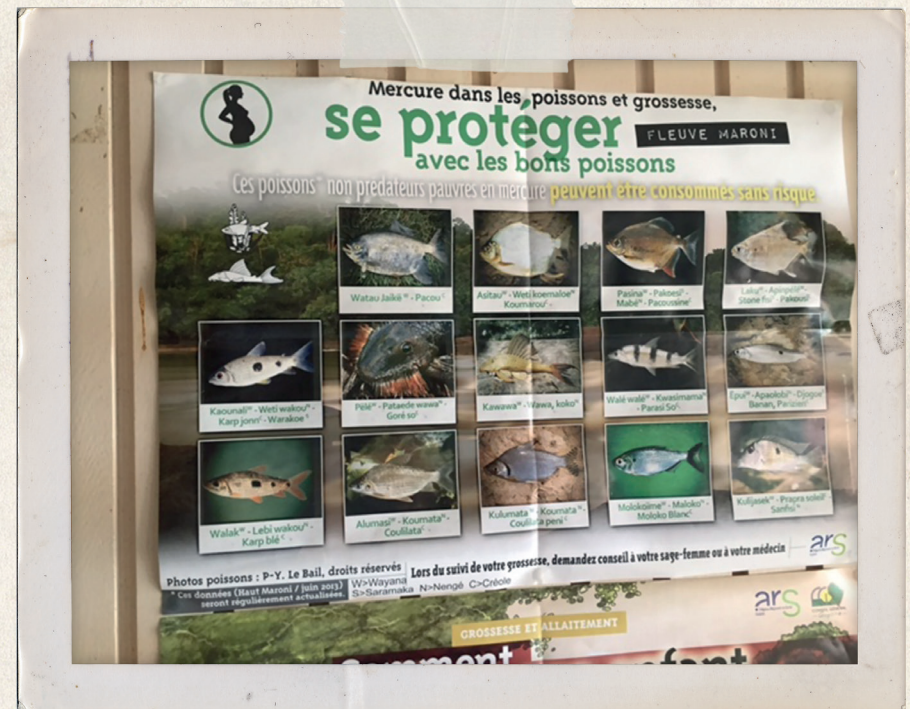
The good fish ...

"On the first Thursday of every month, you'll see a crowd in front of the post-office. People go to collect their minimum social security cheque.