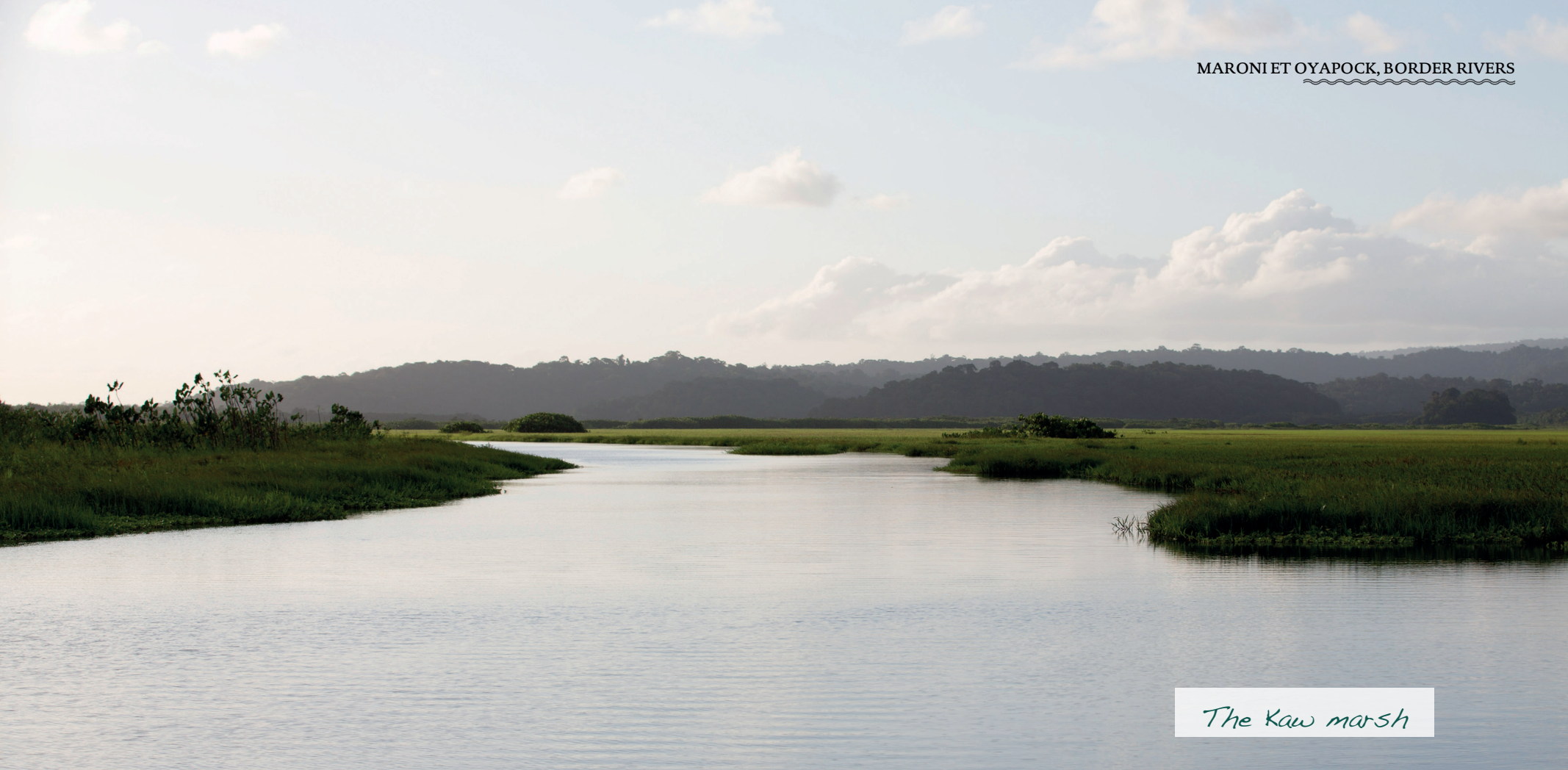
The Kaw marsh