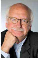
Erik Orsenna Economist and member of the French Academy, Chairman of IFGR

“ Rivers are the grammar of life: they are the links, just as grammar links words ”